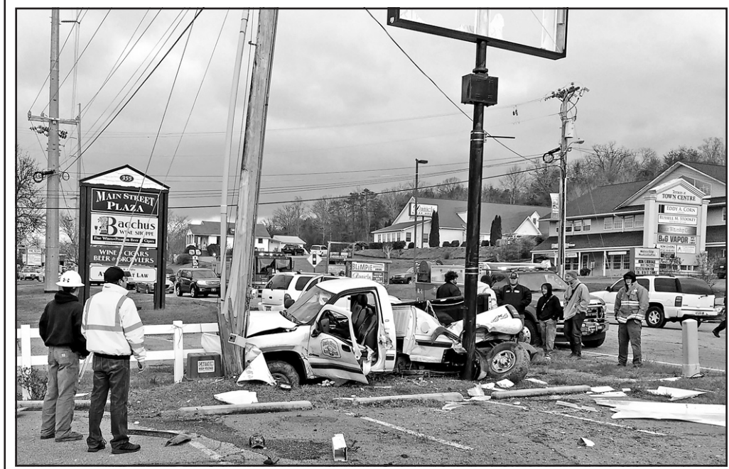
Speed was a determining factor in this Main Street Hiawassee accident back in March, according to the Hiawassee Police Department.

a radar speed sign to alleviate speeding in that area.